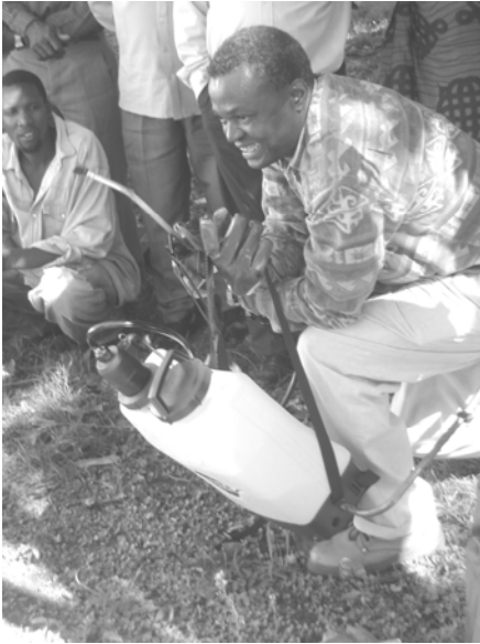
Ensuring that a sprayer is working properly helps reduce environmental damage from pesticides and can prevent dangerous accidents.

done when the weather is calm. Cone nozzles are named for the spray pattern they produce, some producing a hollow cone, others a solid cone.