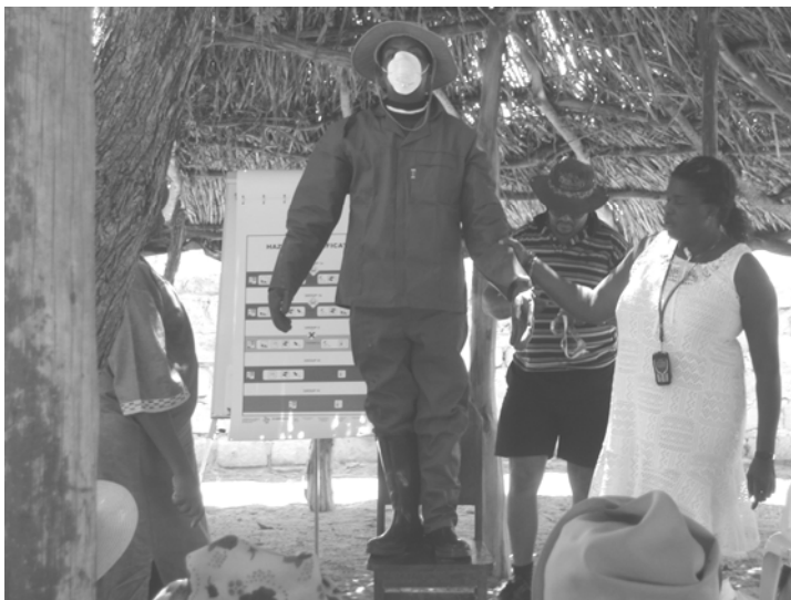
Appropriate, well-maintained equipment is critical for safe pesticide use.

The main elements to be included in pest survey programs are (1) knowledge of pest distribution in time and space and (2) monitoring of environmental conditions and changes that might lead to increased numbers of pest species. This will require some knowledge of pest species' biology, current environmental conditions, and how these conditions can encourage or limit the spread of pests.